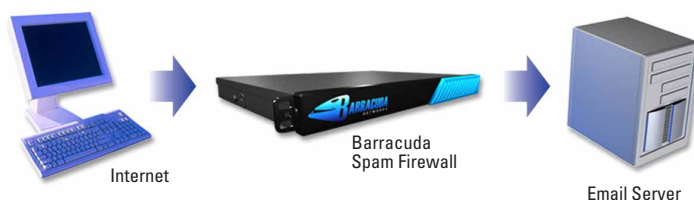
Standard Deployment Configuration