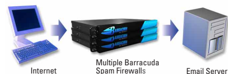
Clustering provides for redundancy and even greater capacity